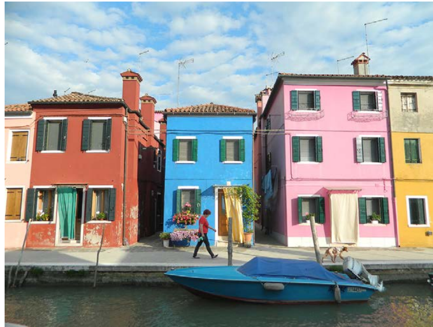
Aviva Abusch (Pierson '18) in Venice, Italy